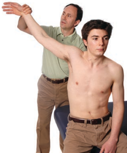
Figure 6 illustrates Wright's test for pectoralis minor syndrome, the third type of TOS. The client's upper extremity is passively moved up and back, while the radial pulse is palpated. Decrease in strength of the radial pulse is positive for pectoralis minor syndrome.

teriorly and inferiorly against the first rib), similar to the military posture of attention (Figure 5). Again, weakening of the strength of the radial pulse would be considered to be a positive sign. This procedure is called Eden's test.