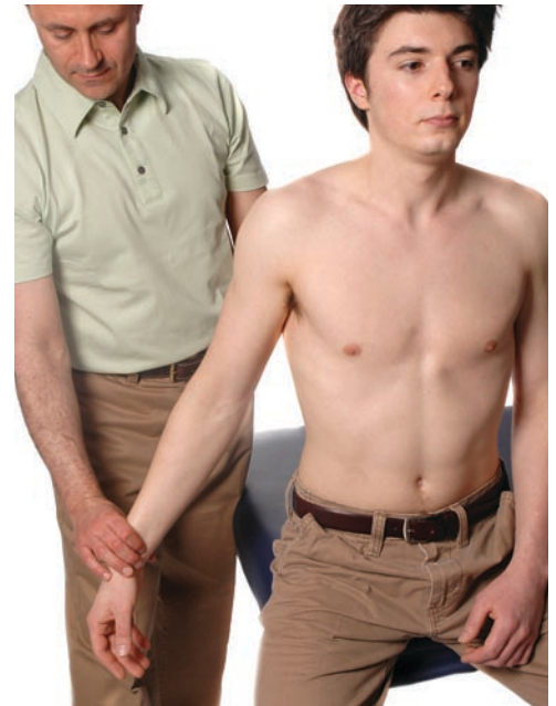
Figure 3 illustrates assessment of the strength of the client's radial pulse when the client is relaxed and in a neutral position. This is done at the beginning of the assessment procedure for each of the three TOS conditions.