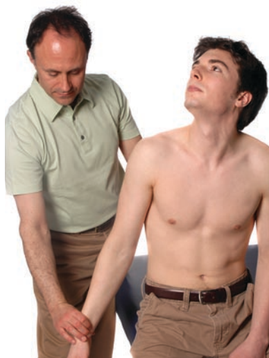
Figure 4 illustrates Adson's test for anterior scalene syndrome, one of the three types of TOS. The client is asked to ipsilaterally rotate, contralaterally laterally flex, and extend his neck at the spinal joints, while the radial pulse is palpated. Decrease in strength of the radial pulse is positive for anterior scalene syndrome.