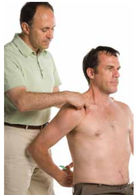
▲ Figure 2: Downward rotation of the scapula is the best action to choose to engage and palpate the pectoralis minor. From Muscolino JE: The Muscle and Bone Palpation Manual, With Trigger Points, Referral Patterns, and Stretching . St. Louis, 2009, Elsevier.

Sometimes the best action varies depending on which part of the target muscle we are palpating. A good example of this is the fibularis longus (FL; formerly named the peroneus longus), located in the lateral leg between the extensor digitorum longus (EDL) which is anterior to it and the soleus which is posterior to it (Figure 3). The FL everts and plantarflexes the foot. So which action is best to choose? That depends on which part of the FL we are palpating. If we are palpating the anterior aspect of the FL, then we need to discern it from the adjacent EDL. In this case, if we ask the client to evert the foot, both muscles will engage (the EDL is also an evtor of the foot) and it will be difficult to discern the FL from the EDL. The better action to choose is plantarflexion of the foot. This will engage the FL, but the EDL will remain relaxed. However, if we are palpating the posterior aspect of the FL, adjacent to the soleus, plantarflexion of the foot is not the wise choice because the soleus also does this action. Here, eversion of the foot is the better choice because it will engage the FL but the soleus will remain relaxed and soft (the soleus is an invertor of the foot).