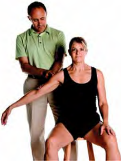
▲ Figure 1: Asking the client to abduct the arm at the glenohumeral joint engages and contracts the deltoid. From Muscolino JE: The Muscle and Bone Palpation Manual, With Trigger Points, Referral Patterns, and Stretching . St. Louis, 2009, Elsevier.

Continuing with this logic, we also know that the anterior fibres of the deltoid flex the arm at the glenohumeral joint so we can ask the client to flex the arm instead to locate the anterior deltoid.